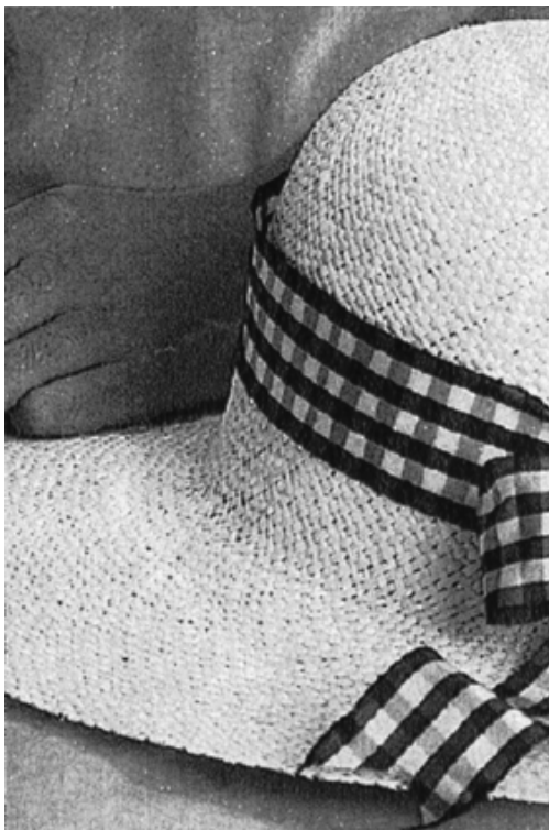
Individual sharpness control for the image