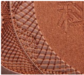
Cellaxy engraves stepless and seamless 2D and 3D embossing forms