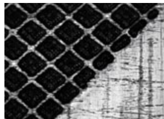
Contour with conventionally lasered edge cells

Due to the process, a gravure cylinder must also be screened in full tone in order to provide the doctor blade of the printing unit with sufficient contact surface. On inclined contours, this often creates small cells that do not print out and make the contour appear less smooth. Merging non-printing cells with neighboring ones improves the printing