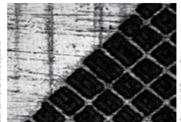
Merging edge cells for an improved printout

The maximum engraving depth of each laser pass depends on the material and application. For example, it is approximately 11 µm in the case of steel and around 30 µm in the case of copper. Comprising several engraving passes, the multipass process is used to achieve larger engraving depths. The special feature of this process is that the direction is reversed automatically